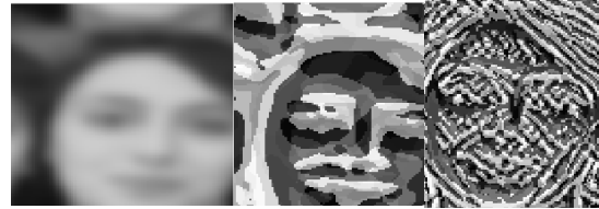
Fig. 2: The first image is a blur image, the second image is LPQ featured image and the third image is MLPQ featured image

In the proposed system the spatial and temporal texture descriptors are utilized for the recognition of face. Firstly, a blur robust face image descriptor which is based on Local Phase Quantization (LPQ) and its extension to a multi-scale framework, multi-scale local phase quantization (MLPQ) is used to increase the effectiveness. The MLPQ descriptors are figured regionally to increase insensitivity to misalignment. Secondly, Binarized statistical image features and its extension to multi-scale framework, multi-scale binarized statistical image features (MBSIF) is applied on three orthogonal planes which displays a promising performance against spoofing attacks. Thirdly, the proposed MLPQ descriptor is combined with the MBSIF descriptor by using kernel fusion which is based on a method called Kernel Discriminant Analysis (KDA). The KDA is used with the spectral regression (SR-KDA) which solves the KDA problems and avoids the costly eigen-analysis computations.